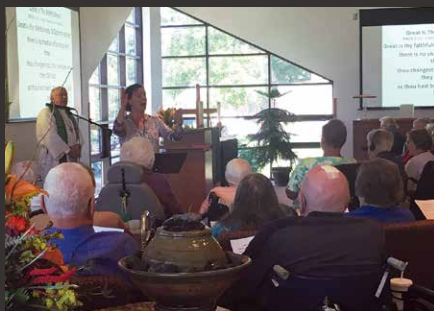
Past and present administration, board members, clergy, member congregants, staff, residents and families enjoyed an afternoon of worship and fellowship as MSLCC marked its 50th anniversary.